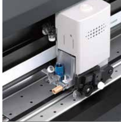
Dual-Position Blade Holder