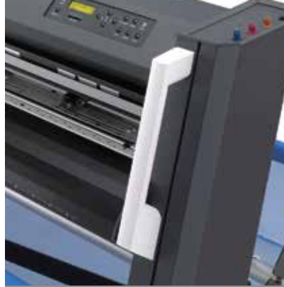
Robust & Easy-to-Move