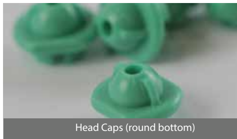
Head Caps (round bottom)