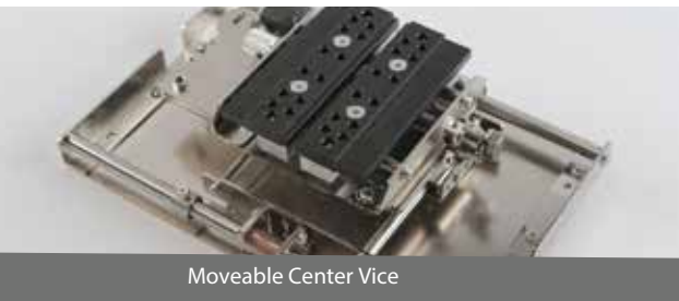
Moveable Center Vice